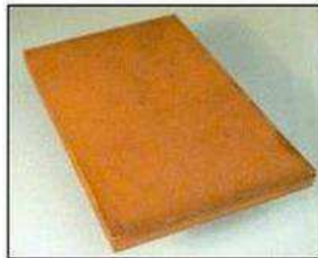
QAP Type Solid Plate