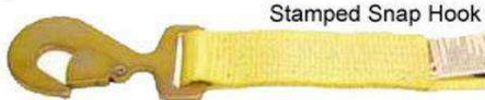
Stamped Snap Hook

# Indicates item not stocked at time of printing - Please enquire for lead time