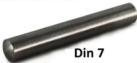
Din 7 Rounded Ends

Catalogue includes dowel pins of type Din 6325 (ISO 2338) and Din 7 in various materials.